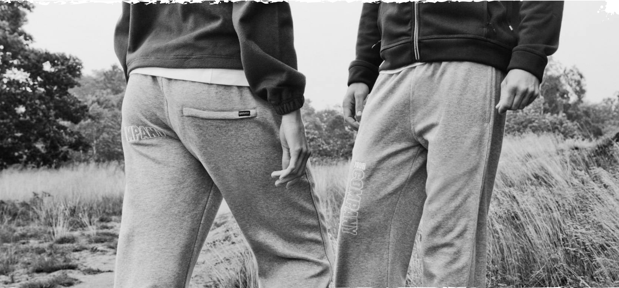
Marsena, Tiffin, Dundee + Prescott, Original T-shirt, Dundee